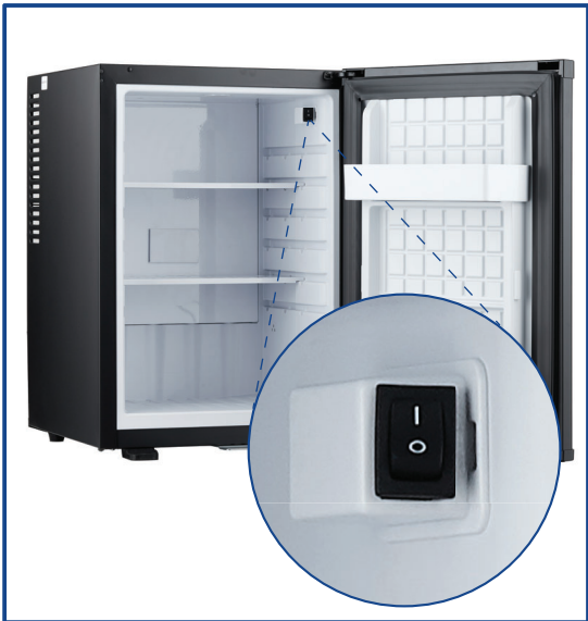
Power Switch - Energy Saving in Unoccupied Rooms (OPTIONAL)