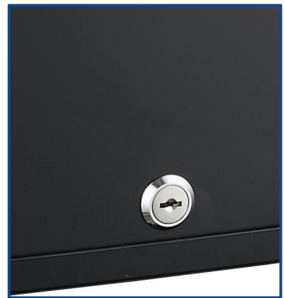
With Key & Lock (OPTIONAL)