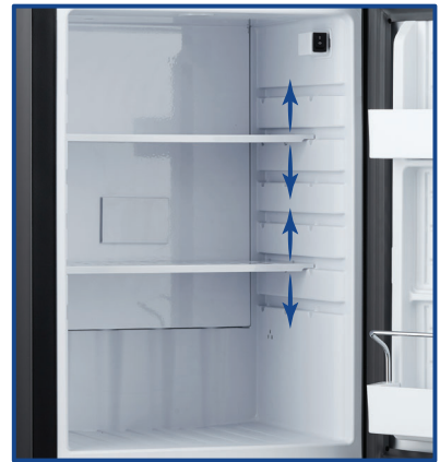
Height-adjustable & Removable Shelves Convenient for Storing Different Size of Drinks & Food